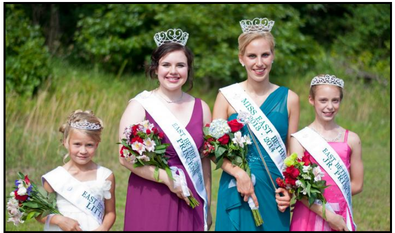
Congratulations to the newly crowned 2013-2014 East Bethel Royalty!

ing in City government for roughly eight years. I look forward to being a positive contributor to the City of East Bethel team.