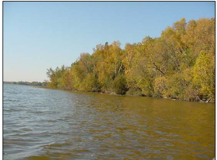
Linwood Lake is one impaired waterbody covered by management plans under development.

shed Management Organization (SRWMO) is central to managing these water bodies. The SRWMO is a joint powers organization covering Linwood Township and parts of Columbus, East Bethel, and Ham Lake. To learn more visit www.SRWMO.org .